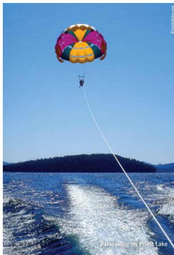
Parasailing on Priest Lake

>> Idaho Panhandle National Forest, Priest Lake Ranger District, fs.usda.gov/recarea/ipnf/recreation/recarea/?recid=6763