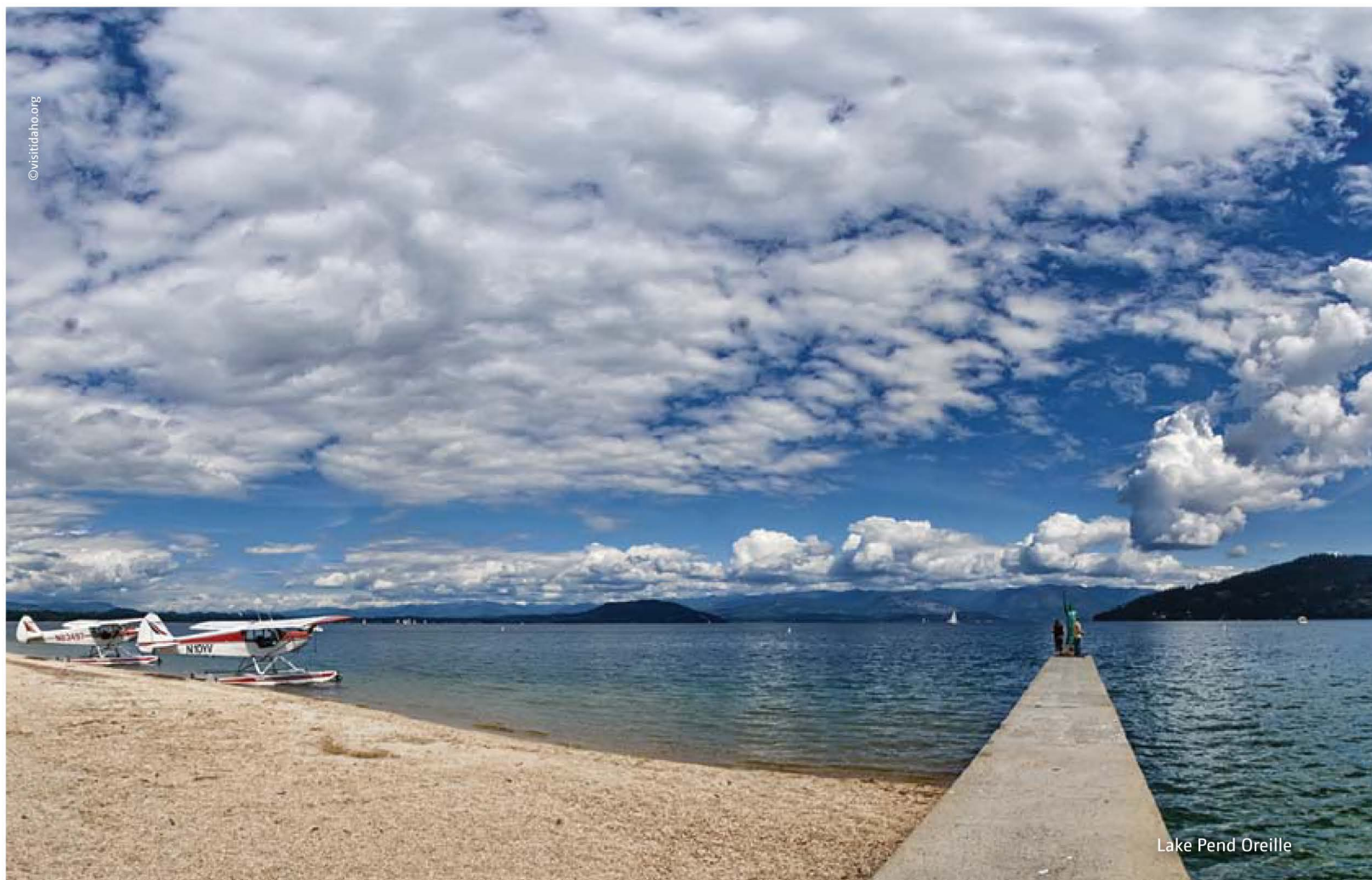
Lake Pend Oreille