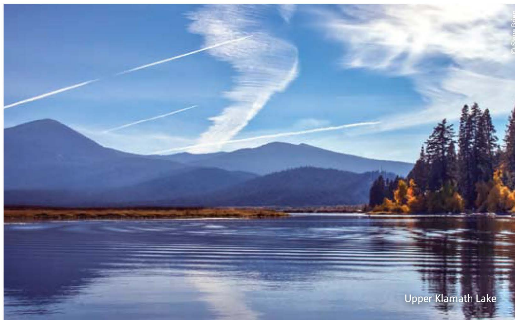
Upper Klamath Lake

>> Klamath Falls Tourism, discoverklamath.com >> Upper Klamath National Wildlife Refuge, fws.gov/klamathbasinrefuges/upperklamath/upperklamath.html >> Rocky Point Resort, rockypointoregon.com